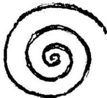
Fig. 2. Same spring unwound to exemplify decenteration.