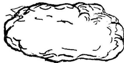
Fig. 3 & 4 represents water concentrated into a drop and decentered into vapor.